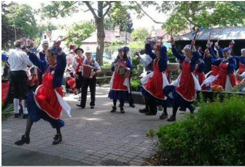
Whitethorn Northwest Morris