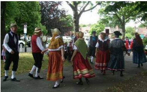
English Miscellany Country Dancers