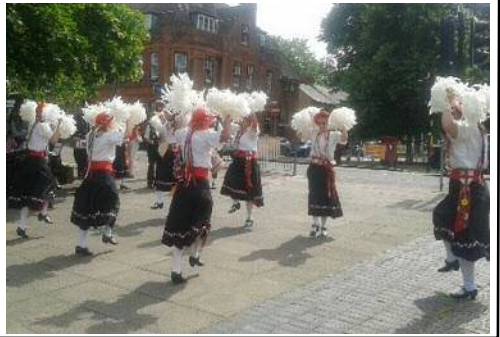
English Miscellany Northwest Morris